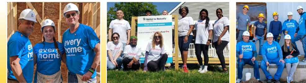
Corporate partner volunteers from Parx Casino • Johnson & Johnson • Penn Community Bank

Corporate partners like Johnson & Johnson, Parx Casino, Penn Community Bank, and countless others have woven themselves into the fabric of our communities, not only by employing area residents but by immersing themselves