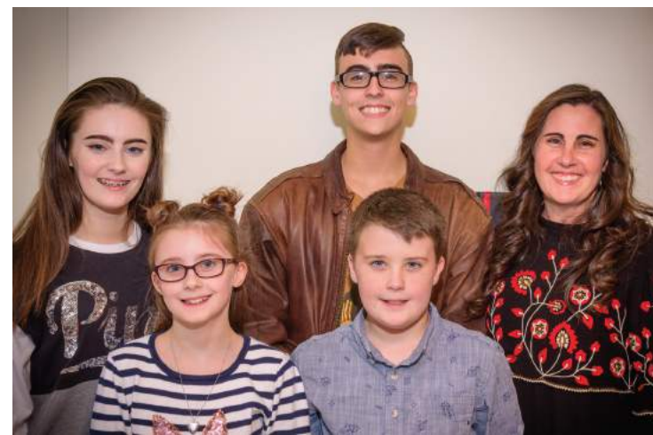
Dawn purchased in Morrisville.