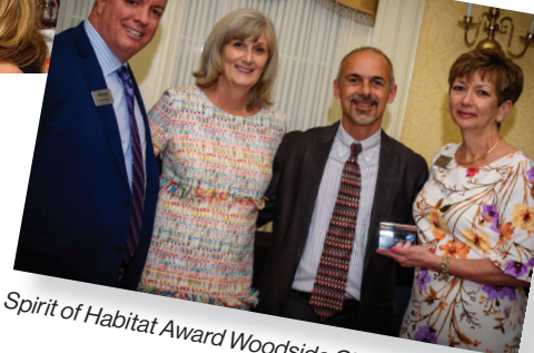
Spirit of Habitat Award Woodside Church