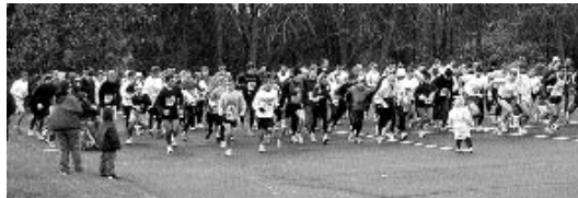
This year's group of 123 runners begins the 5K.