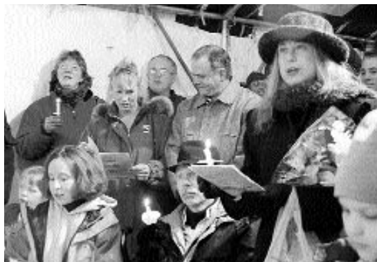
A touching ending to an emotional evening—dedication guests sing during the candle lighting.