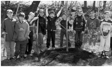
CUB SCOUT PACK #185 POSES AROUND ONE OF THE TREES THEY PLANTED DURING HABITAT BUCKS' GREENSCAPING DAYS.

Thanks to the groups who participated in Habitat Bucks' first installment of the GREENscaping Program: Cub Scout Pack #185 of