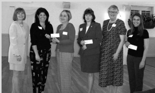
Newcomers and Encores Club members present checks to Habitat Bucks, Gilda's Club and Camp Discovery.

This year the gala was themed, "Passport to the World," and included international foods, a silent auction, a live auction and casino game tables. Patrons ate, drank, danced and gambled the