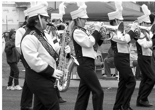
The Central Bucks High School East Marching Band kicked off the celebration of the Habitat/HBA Blitz Build by performing at the Emerald Hollow Community.

Anastasi Company Inc. • AJC Painting Inc. • Allstate Insurance Co.- Brian M. Kelly Enterprises, Inc. • Almo Distributing • Alside Inc. • Arbill Safety Products • B & D Custom Builders • B & F Insulation