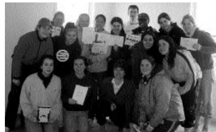
top: The Baptist Student Union of the University of North Carolina, Wilmington