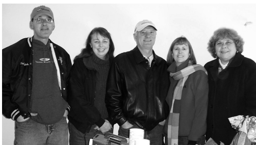
Volunteers from Blooming Glen Mennonite Church.

With so much going on, Habitat simply couldn't succeed without volunteers helping in all aspects of the work. Habitat relies on volunteers for building, serving on committees, helping in the office, advocating the Habitat mission and, of course,