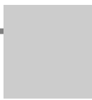
January 2002: TBA